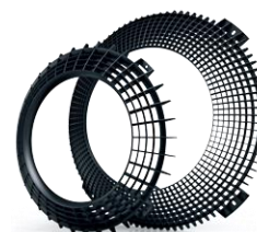
Air inlet grill – FlowGrid Optional

Refer to data sheet for dimensions and wiring