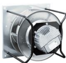
EC centrifugal fans – RadiPac support bracket Fan sizes 355 - 400